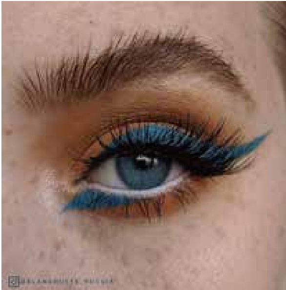
II. «Pearl Aqua blue» gel pencil eyeliner helps to create marine mood