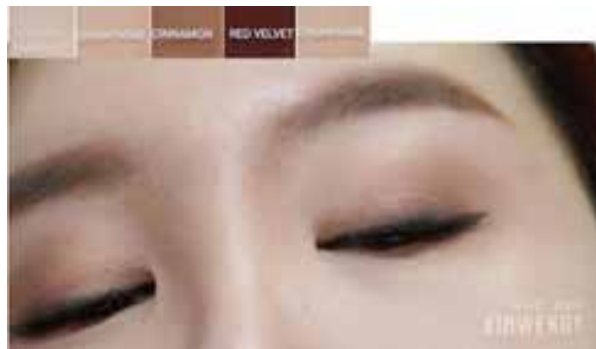
IV. Daily look with Innocent Nude

*The pictures are provided by our followers, bloggers and our partner from Russia, "Lagom" Co.