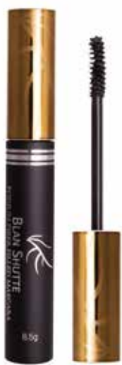
Podium Fiber filled mascara

It's not easy to compete with famous brands which spend six digits marketing funds for advertisement and charge the consumers with their expenditures. However "HS Chemical" launched the cosmetics line "Blan Shutte" two years ago to diversify business opportunities for our partners and add more beauty to the world. Slowly, but for surely the brand expands and finds its lovers. Today we want to present you two eyeshadow pallets and gel eyeliner pencils. Together they make perfect combination to create both a light daily make up and sexy party look very easy.