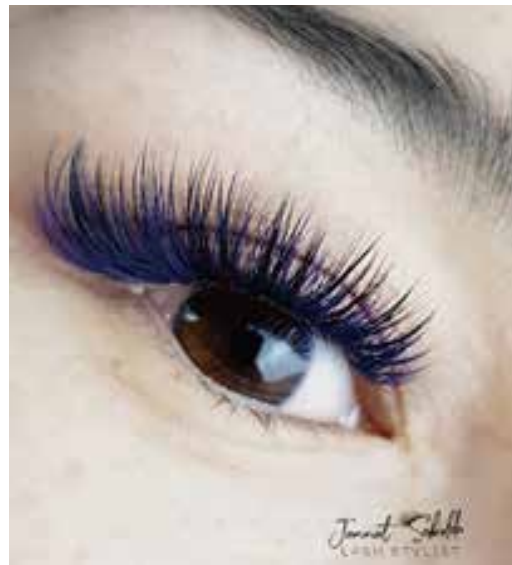
Extension: Base: Dark blue B 0.07 8-11 mm Highlights: Mink black C 0,07 11-14 mm