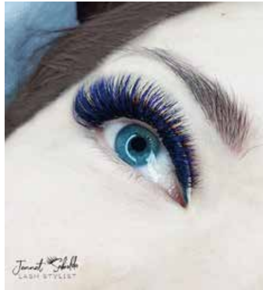
Extension: 4D Eyelashes: Mink C 0.07, Blue 8-13mm Glue: Elite+ Due to the high standard lashes and tape it is easy to make a fan in any methods.