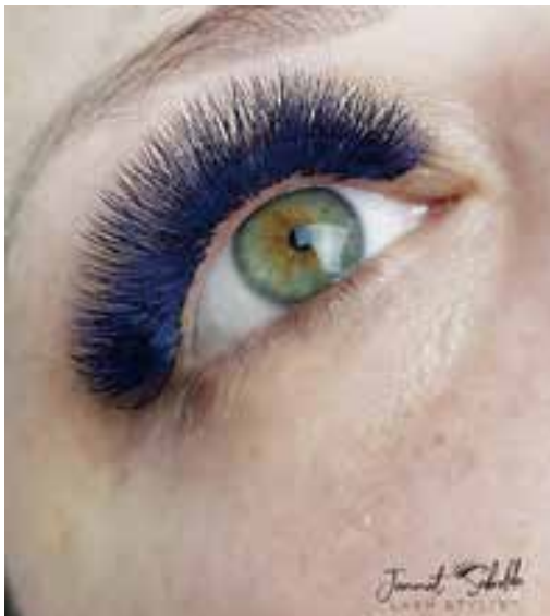
Extension: 4D Eyelashes: Mink B 0.07 7-12mm Dark blue B 0.07 7-12 on the lower layer. The length is the same as black one, to create the Ombre effect