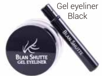
Gel eyeliner Black