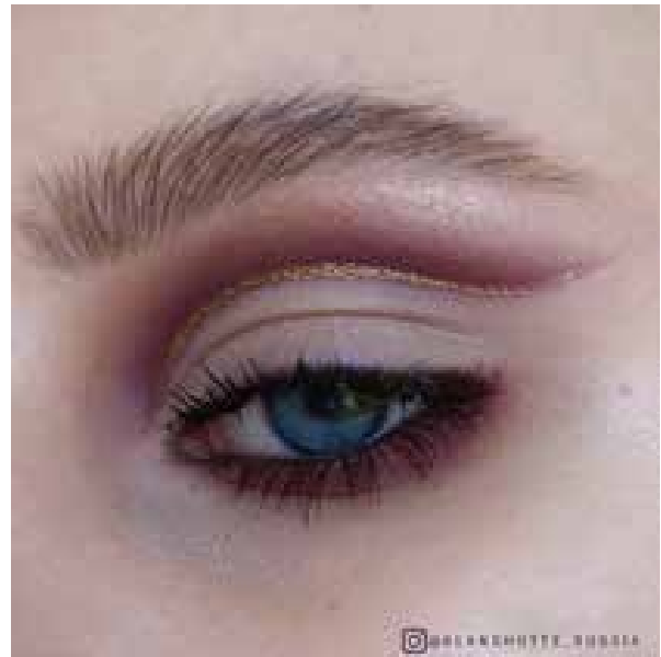
III. Don't be shy! Create your own makeup trend with Blan Shutte Pearl Royal Bronze gel eyeliner and Red Velvet from "Innocent Nude"