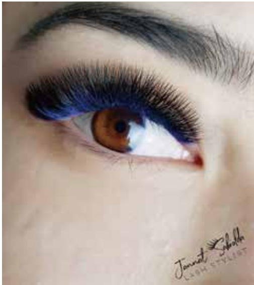
Extension methon: 4D Volume Eyelashes : Mink B 0,07 7-13 mm, Blue B 0,07 7-11mm on the bottom layer. For eyeliner effect Blue eyelashes are shorter than black one.

Sounds ordinary, but don't make snap judgements until you check out the pictures below.